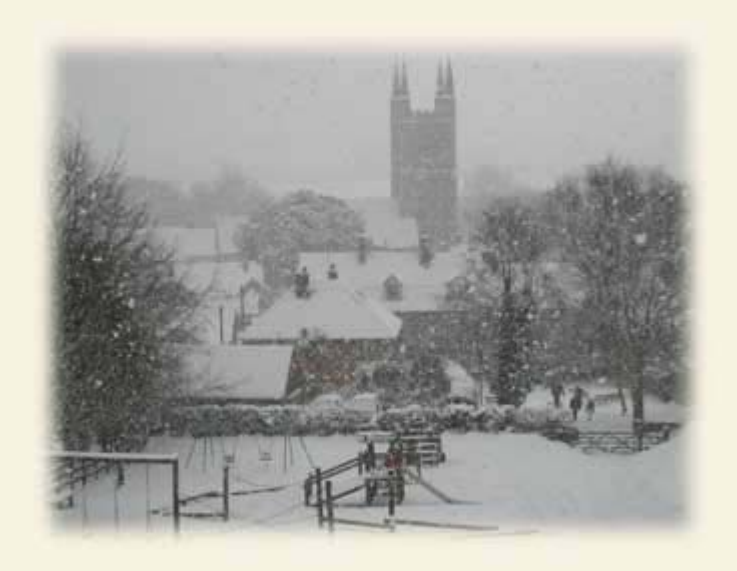
February - 2009

Your community magazine and guide to local events