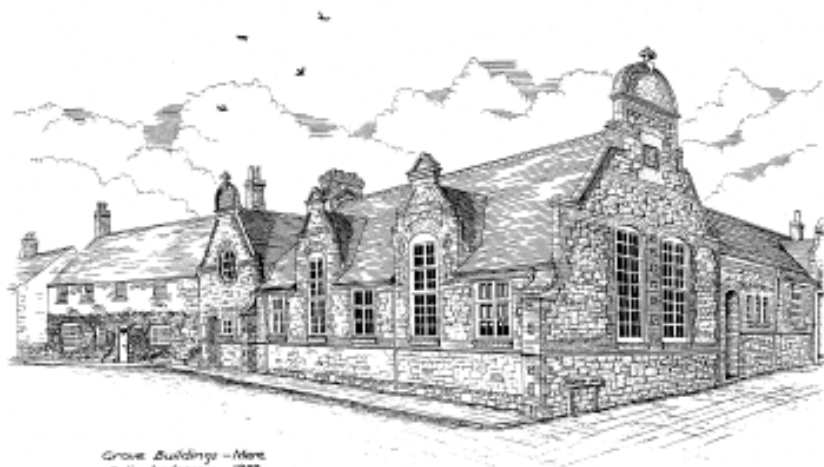
Grove Buildings - Mere

YOUR COMMUNITY MAGAZINE AND GUIDE TO LOCAL EVENTS