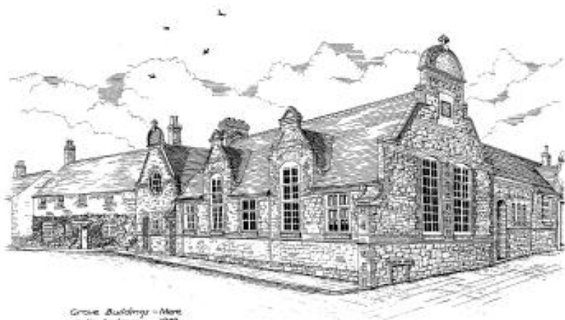
Grove Buildings - Mere Colin Anderson 1992

YOUR COMMUNITY MAGAZINE AND GUIDE TO LOCAL EVENTS