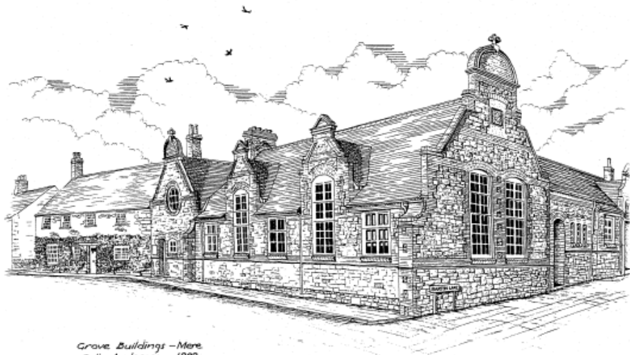
Grove Buildings - Mere Colin Anderson 1992

YOUR COMMUNITY MAGAZINE AND GUIDE TO LOCAL EVENTS