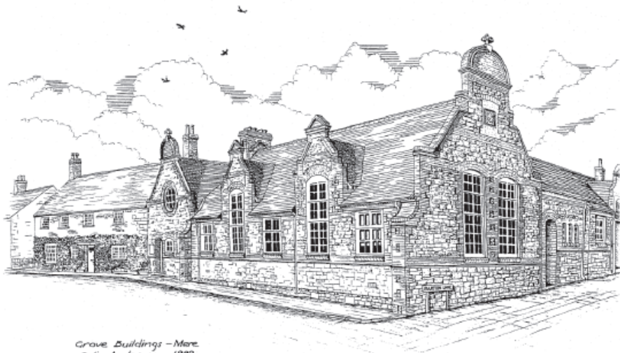
Grave Buildings - Mere Colin Anderson 1992

YOUR COMMUNITY MAGAZINE INCLUDING A GUIDE TO LOCAL EVENTS