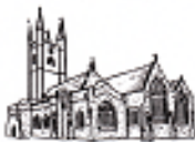
St. Michael the Archangel, Mere Church of England