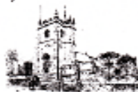
St. Mary the Virgin, West Knayle Church of England