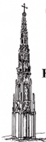
The Parish of Upper Stow Church of England

FRIDAYS 12.30 to 1.30pm February 27, March 6, 13, 20, 27 April 3, 10 (Good Friday)