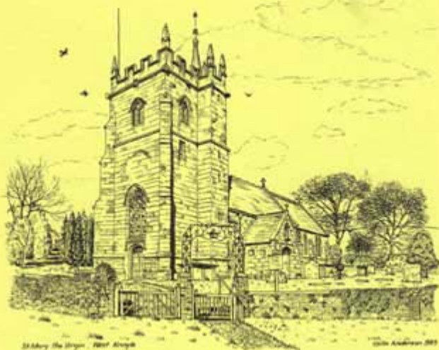
St Mary the Virgin - West Knoyle

YOUR COMMUNITY MAGAZINE AND GUIDE TO LOCAL EVENTS