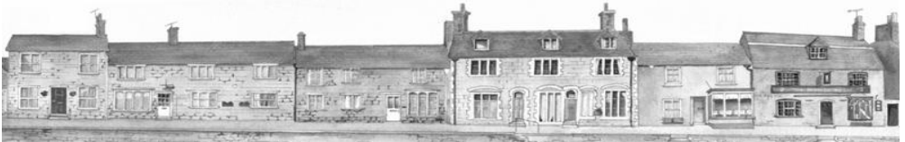
Castle Street, Mere, Barb Ralph, Venue 38