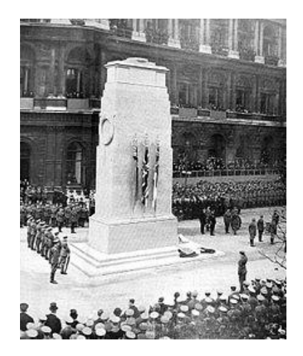
Unveiling of the Cenotaph, 11<sup>th</sup> November 1920

To test public reaction the Government built a mock-up cenotaph to almost exactly the same design and on the same site as at present, timber framed and finished with plaster. It was unveiled just before the Victory Parade on 19th July 1919, when over 16000 service personnel marched past and saluted.