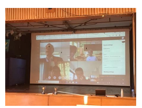
Engrossed in the Teams meeting

We are about to install LED lighting into the public toilets with sensors so that the lighting only comes on when someone walks in, and goes off again when they go out – this should help to save some electricity.