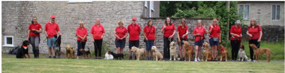
All on parade