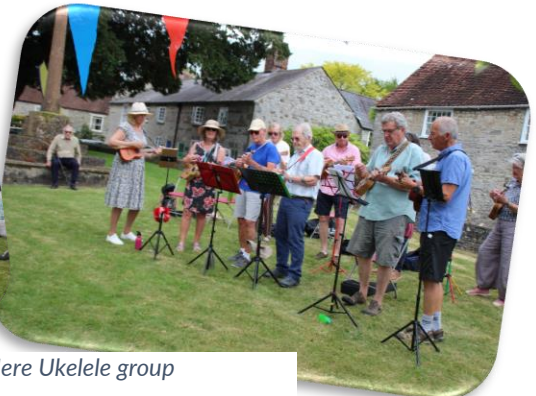
Mere Ukelele group